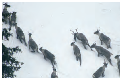
Data collected from caribou radio-collared in 1989

Ultimately, Huebel hopes to determine if helicopter activity disturbs the caribou, either causing them to avoid preferred areas or to move away from preferred areas while helicopters are in the area.