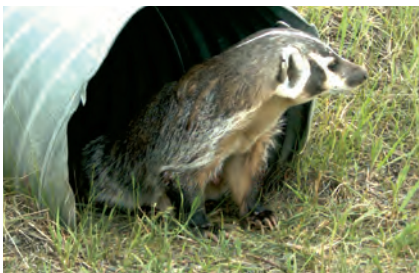
All 300 of Canada's surviving badgers live in BC.