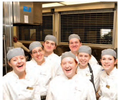
Follow Culinary Art students at http://culinaryarts.blog.mytru.ca/