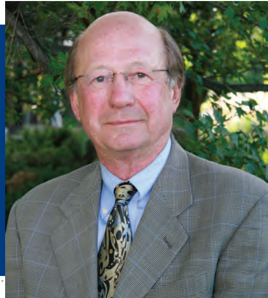
President and Vice-Chancellor's Message

In September 2011 students will begin studies at the TRU School of Law, the first new school of law in Canada in over 35 years.