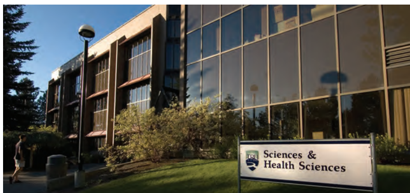
The fossils are housed in a room on the second floor of the science building near the geology lab.

In spite of space issues the institute has started creating a digital database. Last summer TRU funded a museum archive program for the Institute and once it is up to date it will be a major archiving database that other schools and universities will be able to access.