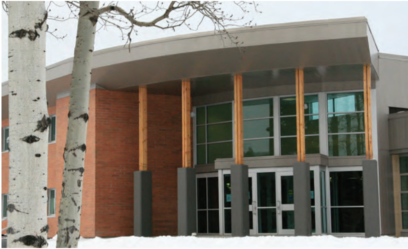
New Williams Lake campus

end of hauling flip-charts, overhead projectors and first aid equipment around town to set up continuing studies classes. “No more renting classroom space,” Bower said. “I’ll always know that classes will be held in venues that meet the right criteria.”