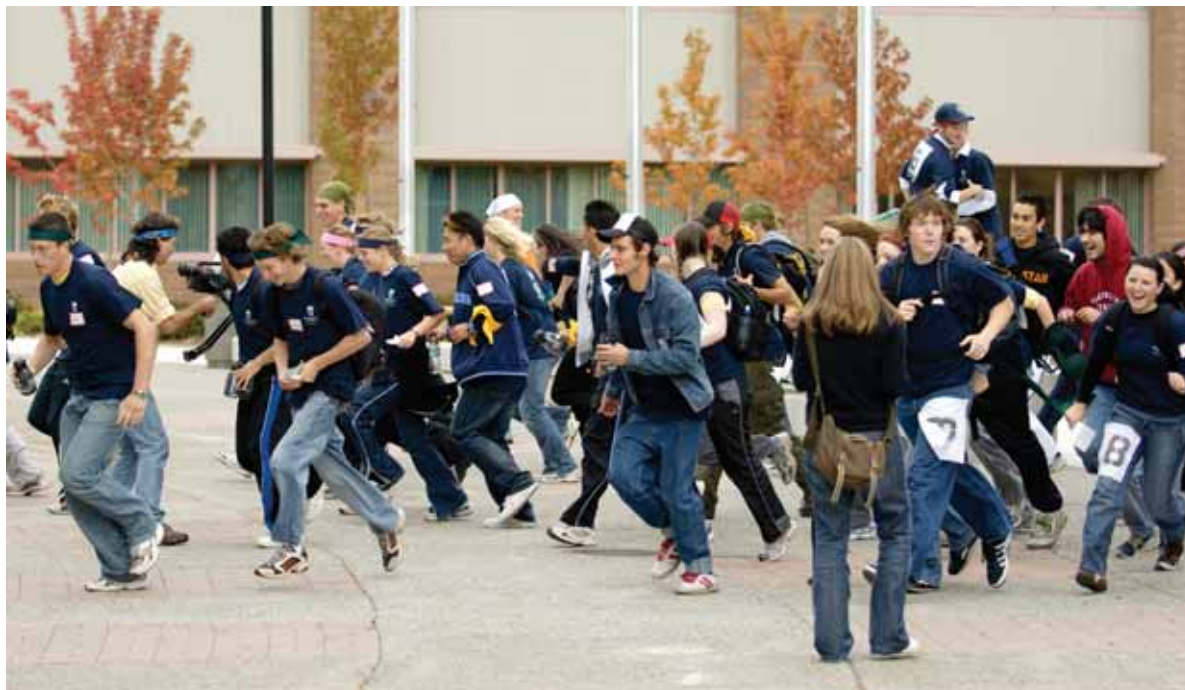
TRU Amazing Race

Recent studies estimate that international activity at TRU contributes $42 million annually to the local economy and is forecast to grow considerably in the next five years.