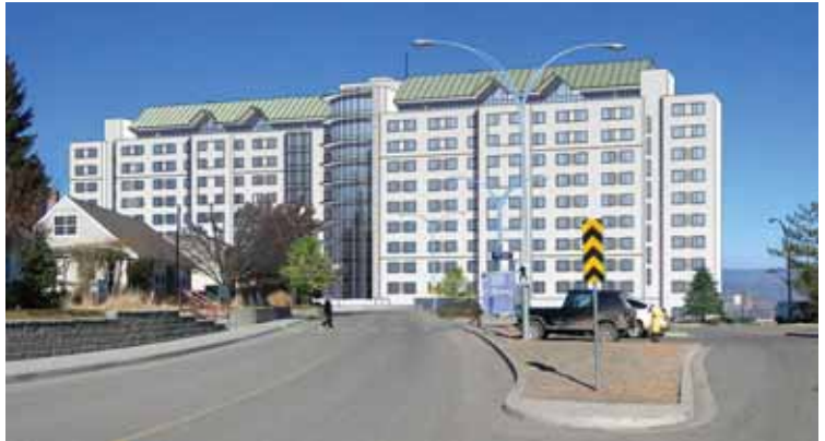
Artist rendering of new residence

Just below the site of the City of Kamloops' multi-million dollar upgrade to Hillside Stadium, construction crews are also hard at work building the BC Centre for Open Learning. The building will facilitate the physical relocation of TRU's open learning division from Burnaby to Kamloops and is expected to be completed in early 2007.