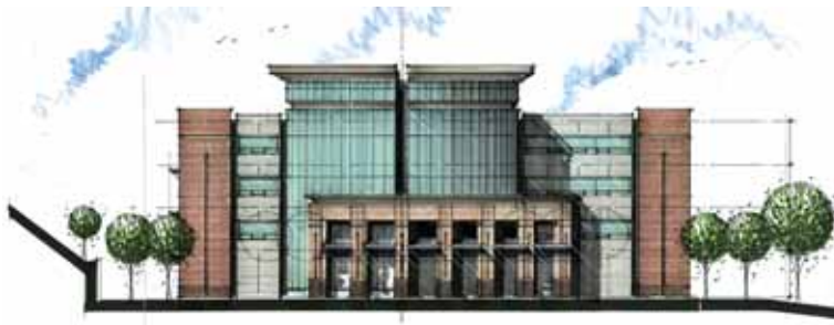
Artist rendering of BC Centre for Open Learning

In Williams Lake, the former Anne Stevenson Secondary School is being transformed into a brand new campus for that community. Expected to be ready in the late fall of 2006, the new campus will bring the programs and administration of TRU Williams Lake back together under one roof and will include automotive and welding shops, an office complex and a Student Street. TRU Williams Lake will also boast of a few options rare in smaller post-secondary facilities--a gymnasium and sports playing field.