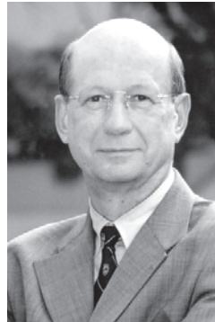
Nancy Greene Raine Chancellor