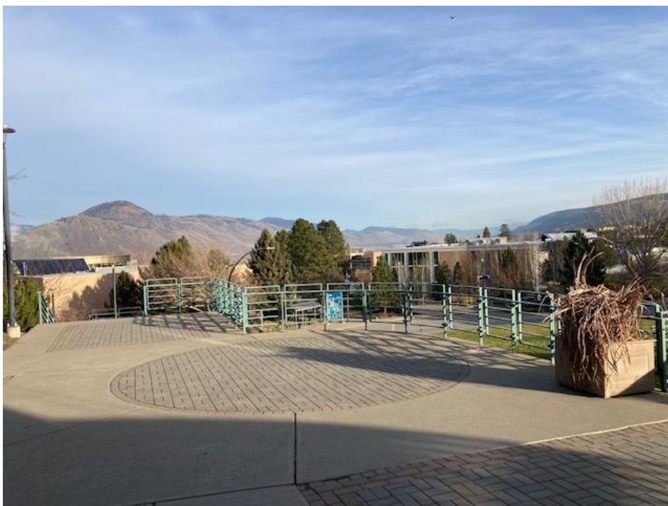
Figure 3. Perspective 2 and Location for the Design within School of Trades and Technology