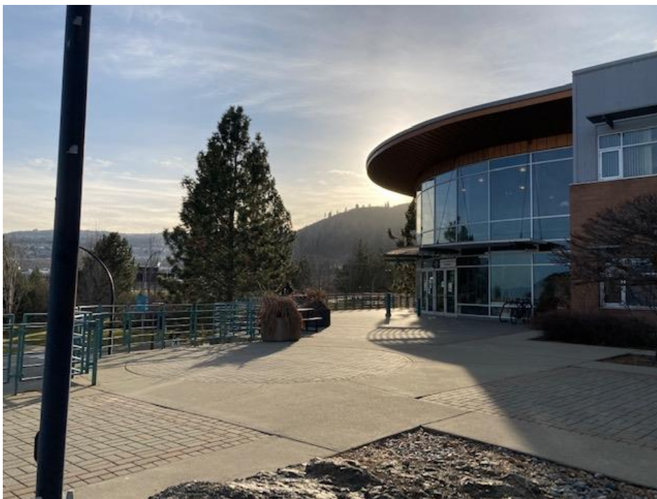
Figure 2. Perspective 1 and Location for the Design within School of Trades and Technology