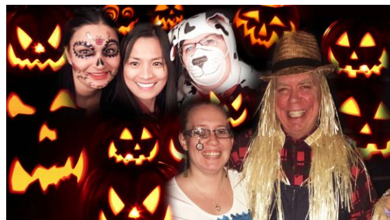
LOL Club Halloween Event, October 31 st , 2016