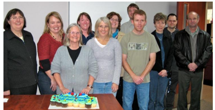
The Project SAGE Student Team takes some time out to celebrate

The Project Technical Team will continue to focus on data conversion activities and the unique requirements of TRU tutors, exam scheduling, and level one integrating FlexReg with WinPrism, TRU's Book Store application.