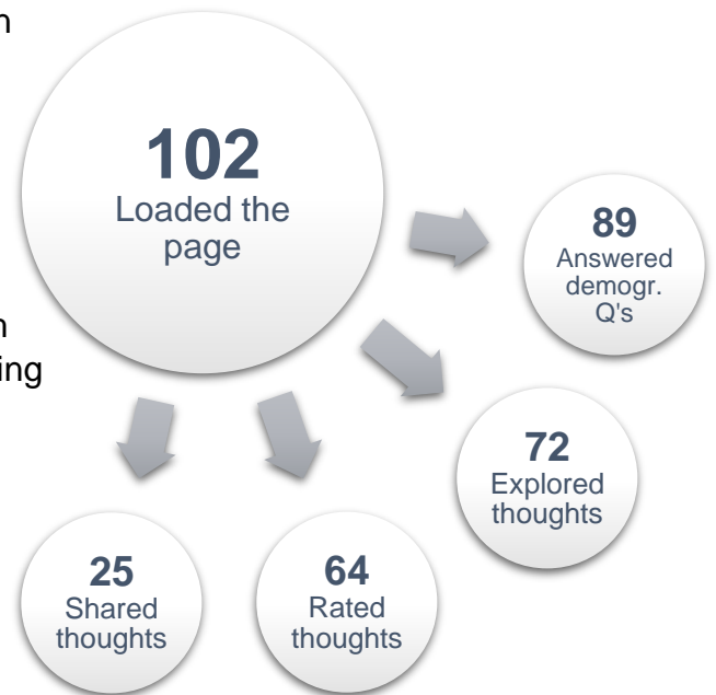
Figure 1. Participants

Thoughtexchange is an online platform that brings people together to anonymously share and communicate thoughts about a given subject and rank those that have already been submitted by others. This exchange, which ran from June 19 to October 8, asked participants: