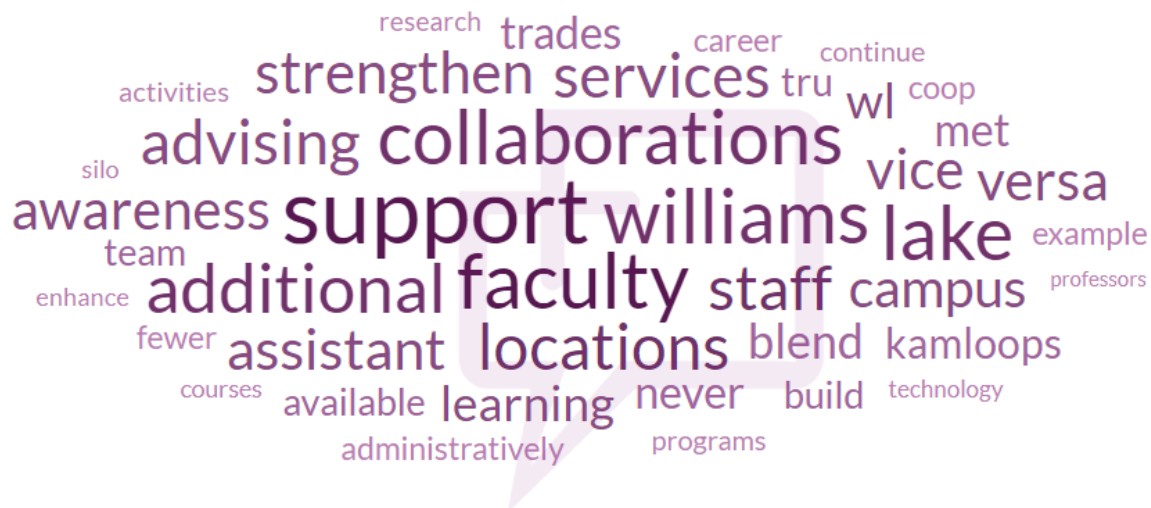
Figure 3. Word Cloud

A frequency analysis (Figure 3) of terms, within the 30 thoughts that were shared, revealed that supporting employees to collaborate and raising awareness were a central focus of this discussion, which was also reflected in the top two thoughts.