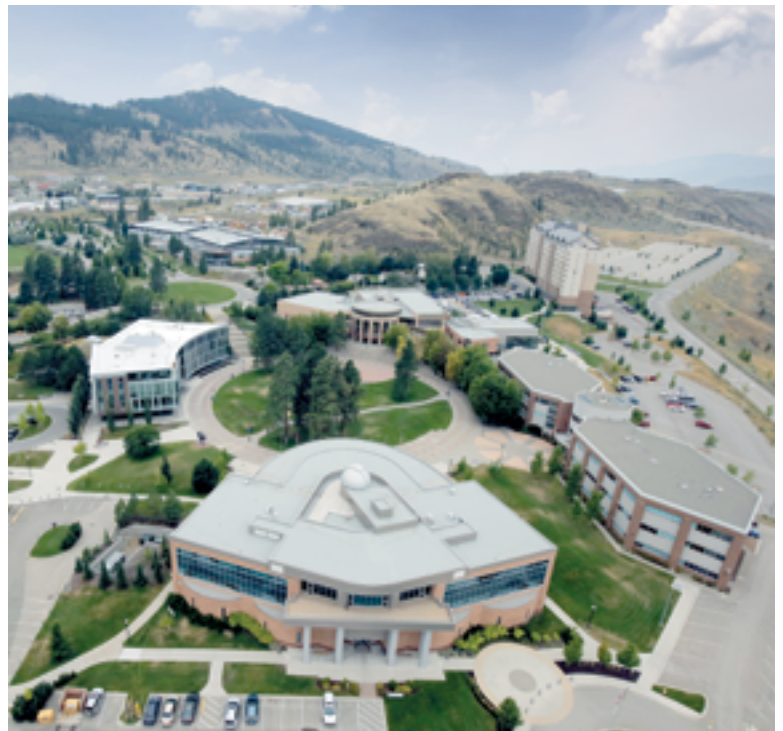
TRU Campus, located in the heart of Kamloops

For over 25 years, Thompson Rivers University (TRU) has been delivering customized training programs of the highest calibre, earning us worldwide recognition. Our intensive, short-term programs are strategically balanced to maximize learning opportunities while allowing participants enough time to gain an appreciation of Canadian culture and participate in carefully selected activities. The result is a rich and rewarding experience that will last a lifetime.