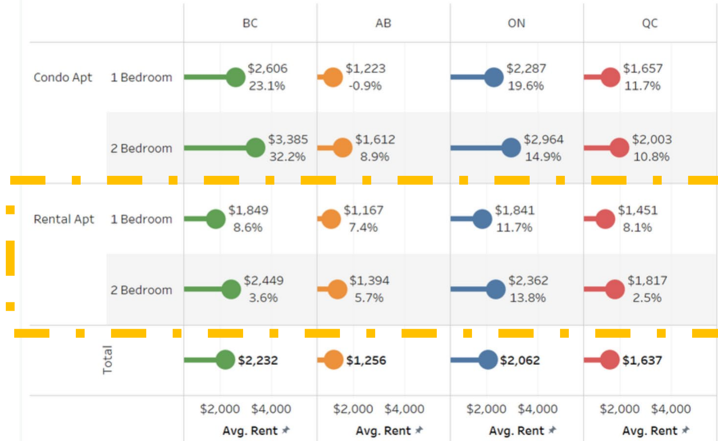
Average Rent and Annual Change in Average Rent for Condo and Rental Apartments by Bedroom Count, Select Provinces, July 2022