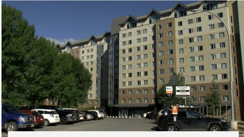
TRU Housing