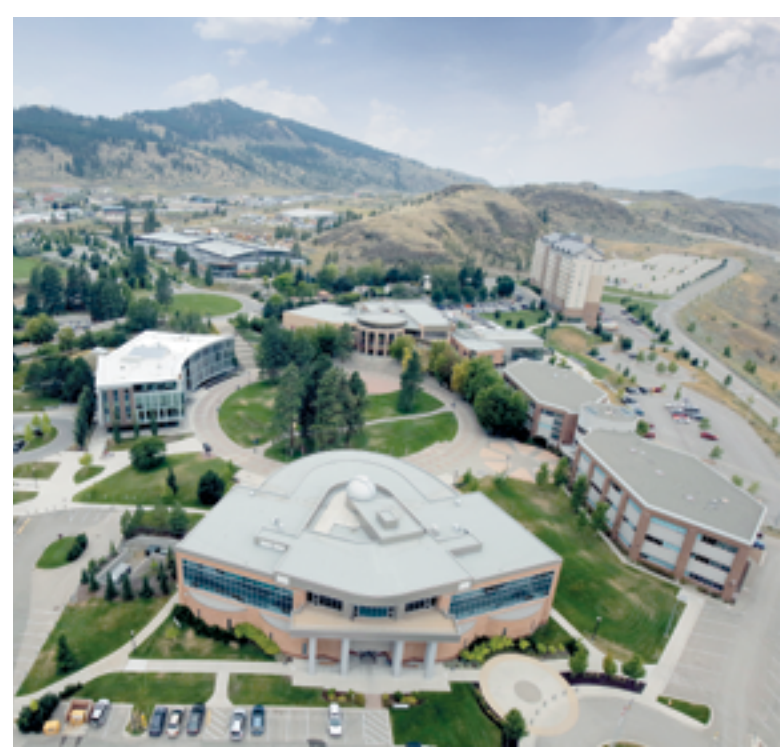
TRU Campus, located in the heart of Kamloops

For over 25 years, Thompson Rivers University (TRU) has been delivering customized training programs of the highest calibre, earning us worldwide recognition. Our intensive, short-term programs are strategically balanced to maximize learning opportunities while allowing participants enough time to gain an appreciation of Canadian culture and participate in carefully selected activities. The result is a rich and rewarding experience that will last a lifetime.