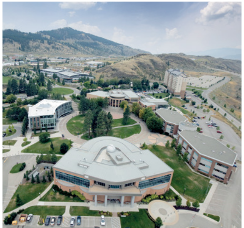
TRU Campus, located in the heart of Kamloops

For over 25 years, Thompson Rivers University (TRU) has been delivering customized training programs of the highest calibre, earning us worldwide recognition. Our intensive, short-term programs are strategically balanced to maximize learning opportunities while allowing participants enough time to gain an appreciation of Canadian culture and participate in carefully selected activities. The result is a rich and rewarding experience that will last a lifetime.