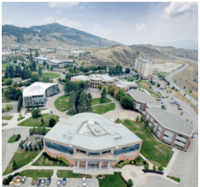
TRU Campus, located in the heart of Kamloops

For over 25 years, Thompson Rivers University (TRU) has been delivering customized training programs of the highest calibre, earning us worldwide recognition. Our intensive, short-term programs are strategically balanced to maximize learning opportunities while allowing participants enough time to gain an appreciation of Canadian culture and participate in carefully selected activities. The result is a rich and rewarding experience that will last a lifetime.