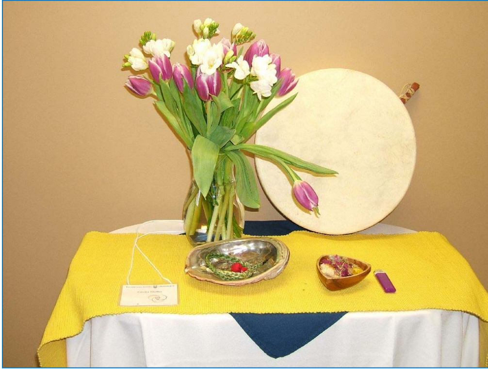
"To Do Our Work in a Good Way"