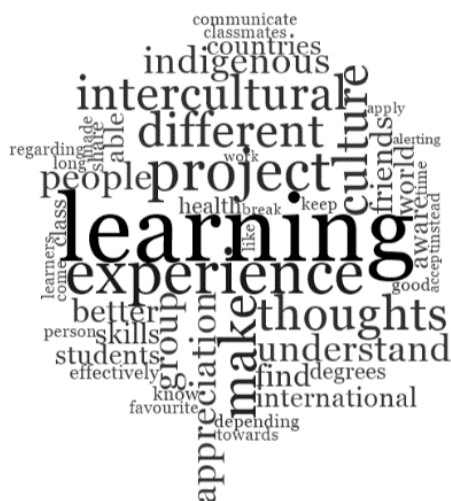
Figure 1 Word Cloud from Narrative Data

Engagement: Analysis of the engagement statements addressed the mechanisms or conditions that positively influenced engagement in intercultural learning. Four main themes emerged as influences: Professors, Curricular, Co-curricular, and Peers. The data provided evidence that student intercultural learning is taking place both inside and outside the classroom; however, engagement takes place primarily through structured and facilitated learning (e.g., coursework or ambassador programs). Note: 2020-21 all learning was online and in future years we will likely see more engagement in events that normally take place on campus.